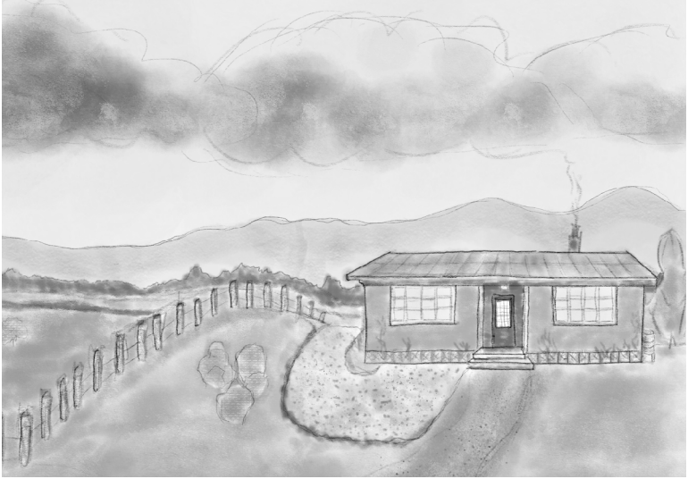
The Farmhouse — Whare Pāmu