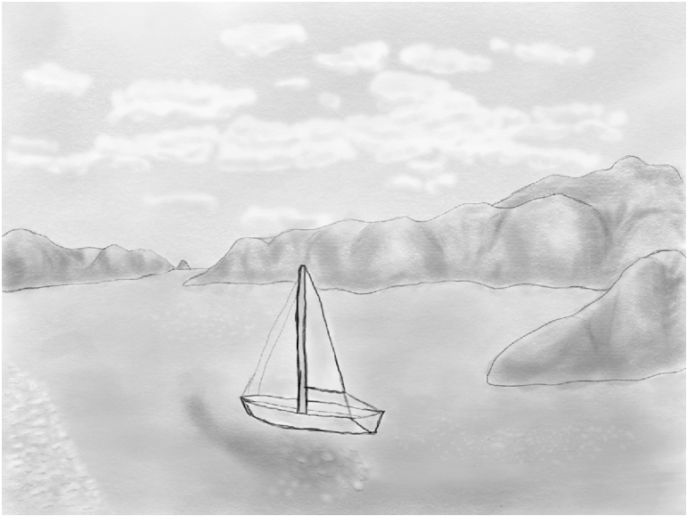
The Sailboat — Waka Tere